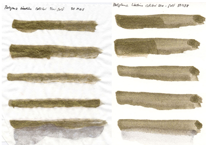
Hot Pressed Paper