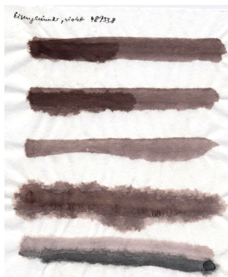
Chinese Rice Paper