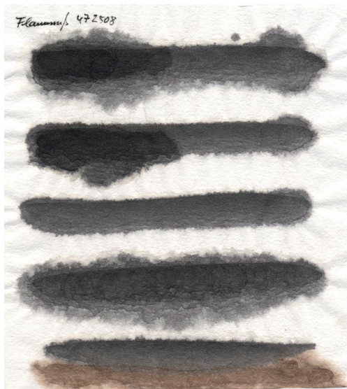
Chinese Rice Paper