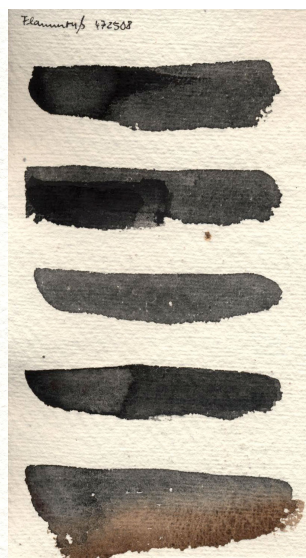
Cotton Rag Paper