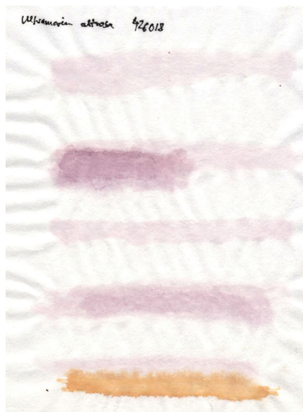
Chinese Rice Paper