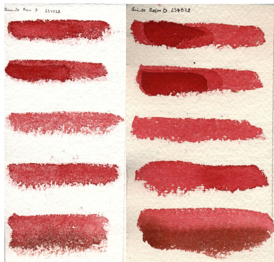
Chinese Rice Paper